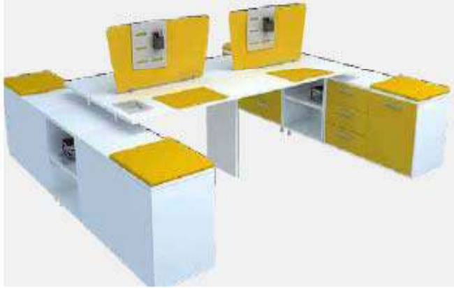
DESKING & CONFERENCE