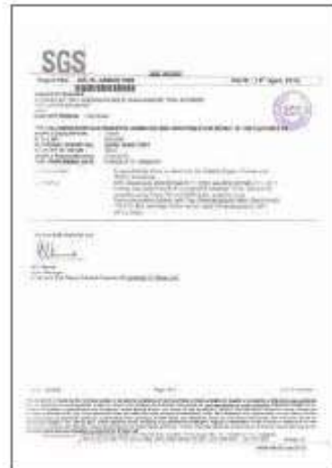
ANSI/BIFMA - SGS TESTED