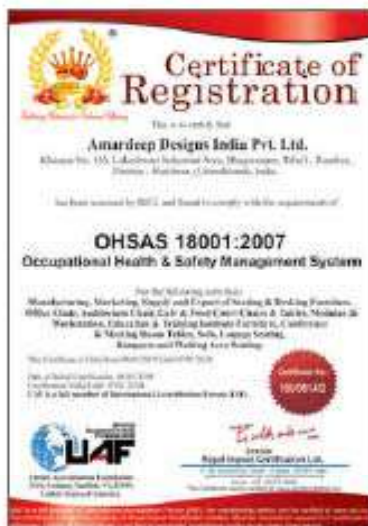
ISO 18000-2007 OHASAS