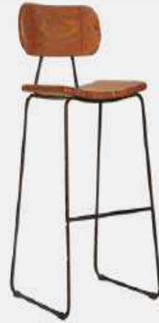
CAFE & FOOD COURT