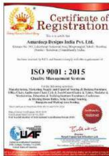
ISO 9001-2015- QMS