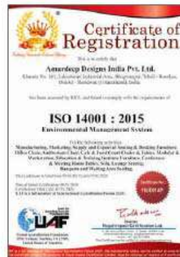
ISO 14001-2015 EMS